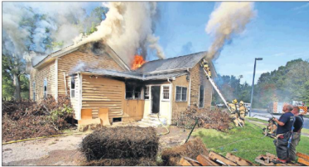
Bethlehem Church donated property where the Gaston County Children's Advocacy Center will build their new facility. Here, area firefighters train as they burn the old structure which had occupied the property Friday morning, Oct. 5, 2018.

seen a sharp increase in the number of interviews with children over the past year, warranting the need for a larger facility, said Kauffman. The Lighthouse has been operating in the Highland Health Center since April 2016. The house on Bethlehem Road was previously used by Bethlehem Church and for group meetings from other organizations. The new facility will feature a dedicated therapy wing for individual and group therapy, and the ability to offer play therapy. It also will have a more homelike atmosphere with living room and kitchen settings and other general living spaces. The building plan is still a work in progress, though Kauffman showed a preliminary design Friday. These plans call for a one-floor layout in a 7,700-square-foot space. Kauffman said the project "has been a dream for a long time" and expressed her gratitude for the community's support, particularly Bethlehem Church. "It's an extremely, extremely gracious offer