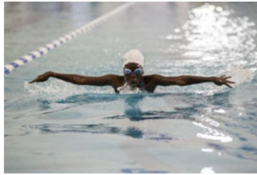
Training & Competition