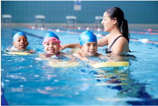
Swim Instruction & Aquatic Proficiency