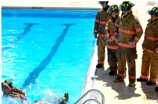
First Responder Training