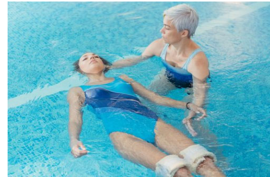
Therapy & Wellness