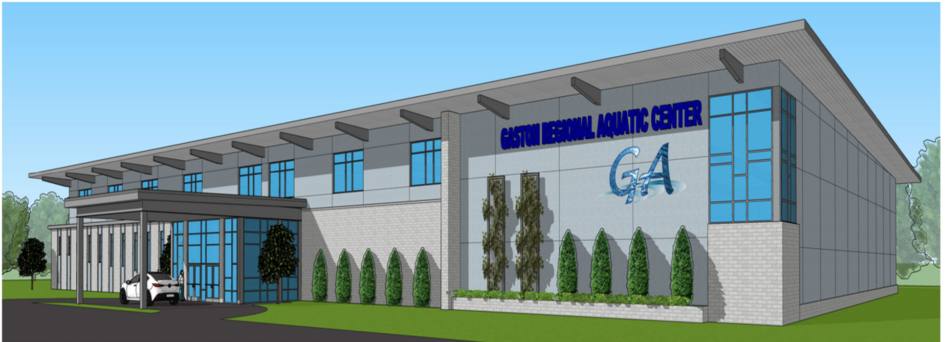
Front Entrance, Design View