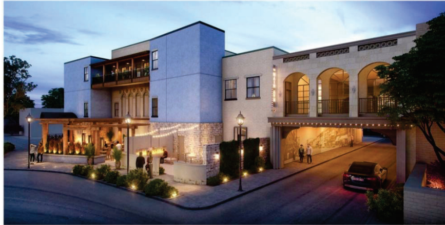
BUILDING D DRIVE | CONCEPT VIEW AT REAR PARKING AREA CNR 1920 | GASTONIA, NORTH CAROLINA | DECEMBER 2023