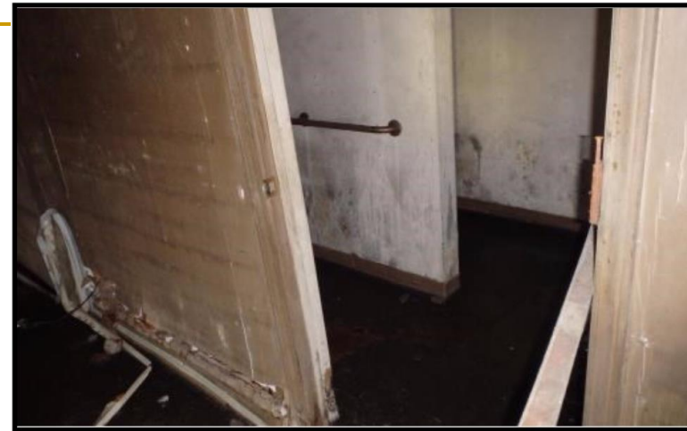
Photo 10: View of ACM vinyl floor tile in the bathrooms of building 2232. Also pictured is drywall and joint compound found to contain <1% chrysotile.