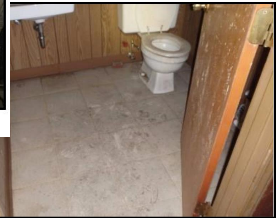
Photo 9: View of of ACM vinyl floor tile located in the bathrooms of building 2224.