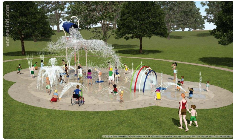
Dallas Park Splashpad®, NC Revision 00 - Phase 01 - 26470