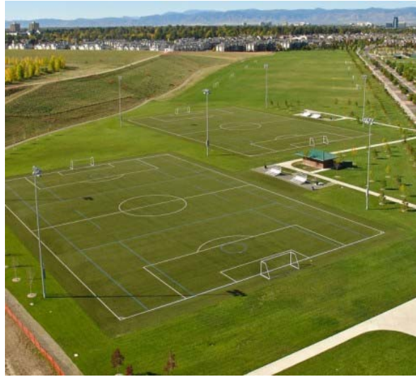
Community Parks & District Parks