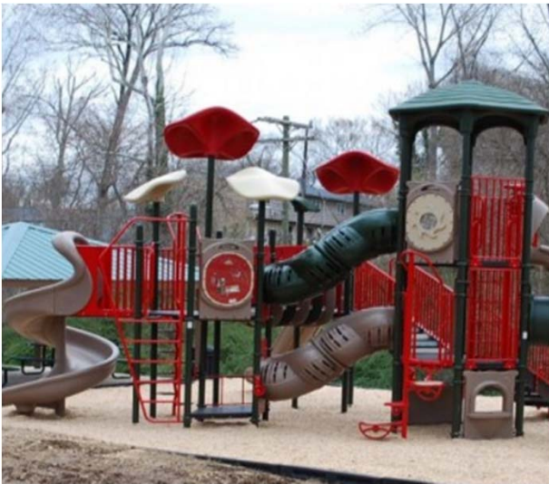
Mini & Neighborhood Parks