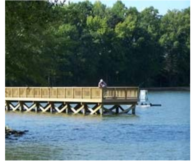
Regional Parks & Greenways

Special Use Facilities: Indoor Recreation Facilities, Senior/Teen Centers, Aquatic Facilities