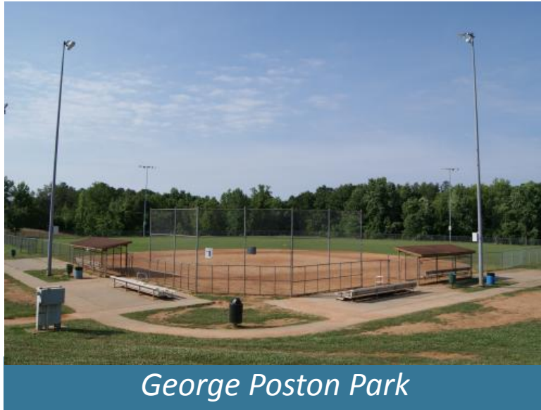
George Poston Park