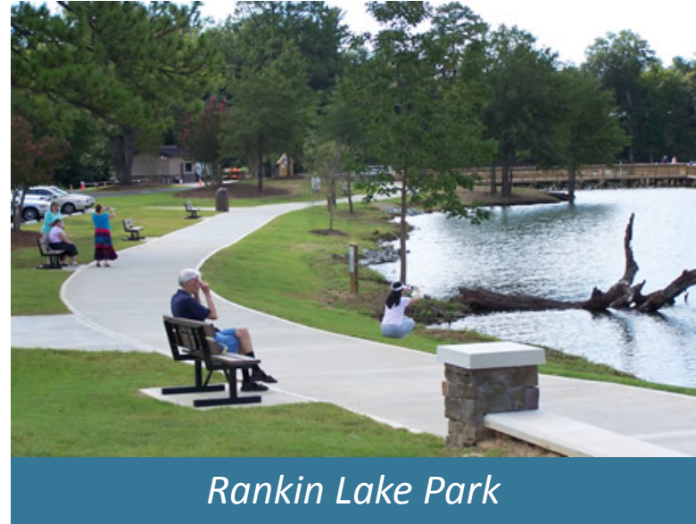
Rankin Lake Park